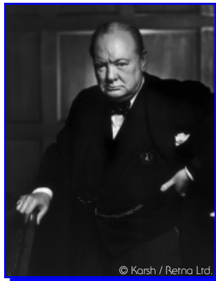
Winston Churchill

ing, impatient, indomitable, passionate, daring, stubborn and many times wrong, but he simply would not take "no" for an answer. By sheer force of will he imposed on a sometimes reluctant and doubting Parliament and military the imperatives of his far-ranging imagination.